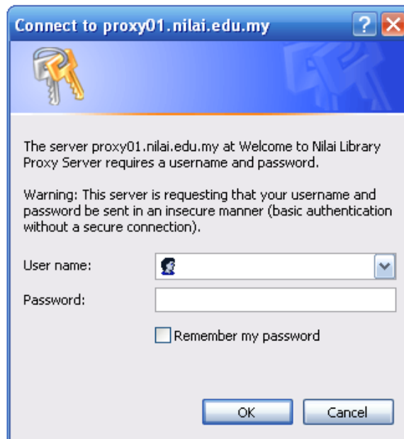
FigureB-1: Microsoft Internet Explorer authentication Page